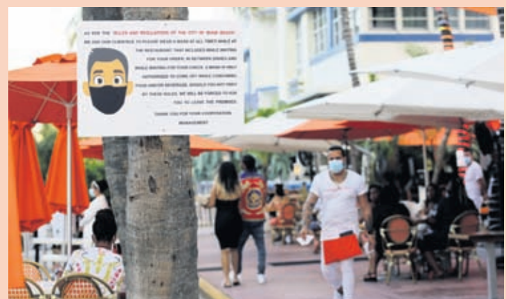
A sign informs customers at the Edison Hotel restaurant about wearing a protective face mask during the coronavirus pandemic, Friday, July 24, 2020, along Ocean Drive in Miami Beach, Fla.

The state health department recorded 781 COVID-19 deaths over the past week for an average of 126 deaths per day on Sunday, down slightly from Saturday's weekly average of 127 deaths per day. Florida had 5,972 total deaths as of Sunday, according to the Florida